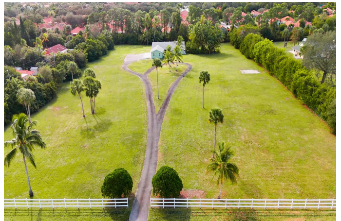
4656 LILLIAN AVENUE, PALM BEACH GARDENS, FL 33418 00-42-42-24-01-000-0860 & 00-42-42-24-01-000-0861