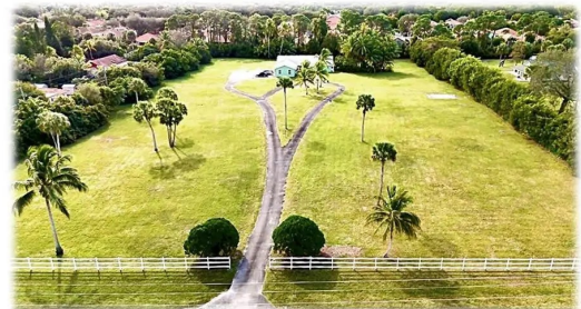
FOR SALE WITH DEVELOPMENT POTENTIAL $3,000,000.00

THE ONLY RESIDENTIAL FRONT TO BACK ESTATE LOTS- 4.63 ACRES EAST OF THE TURNPIKE FOR SALE WITH POTENTIAL FOR